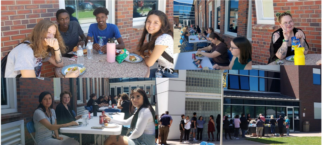
Students, staff, and faculty enjoyed a Welcome Week Lunch on the Valley Campus.

TSC Welcome Back Events. First week of welcome back events kept students busy outside of the class time. Events and activities included welcome back BBQs at both campuses; sponsored movie event; tail-gating games; s'mores at the student center; and cheering on the lady Trojan volleyball team at the SoCo Tourney. At Trinidad Campus Sodexo provided a BBQ dinner that was attended by 220 students along with faculty and staff. Club sponsors were at sign-up tables sharing exciting and fun club information with students. Scrumpy Moo's (from Monte Vista) provided the BBQ lunch at the Valley Campus that was attended by 120 students, faculty and staff.