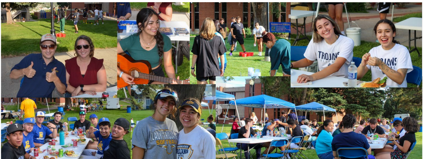
Welcome Week BBQ was fun on the Trinidad Campus last week.

Two of the students gave graduation speeches that were impactful and memorable. One student started crying during his speech when he made the comment that this was the first time, he had ever heard the National Anthem sang (My husband joined me to sing the National Anthem 🥰). CSP is also the facility where we have our first two Second Chance Pell graduates that are serving life sentences. CSP did an amazing job of hosting Trinidad State College and repeatedly stated they were so pleased with the outcome of the ceremony since they had never done anything like this prior. TSC and CSP look forward to making this an annual event.”